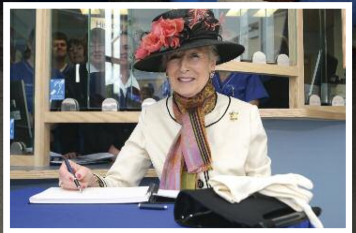
▲ HRH Princess Alexandra, the Hon. Lady Ogilvy, KG, GCVO, officially opened the new PetAid hospital